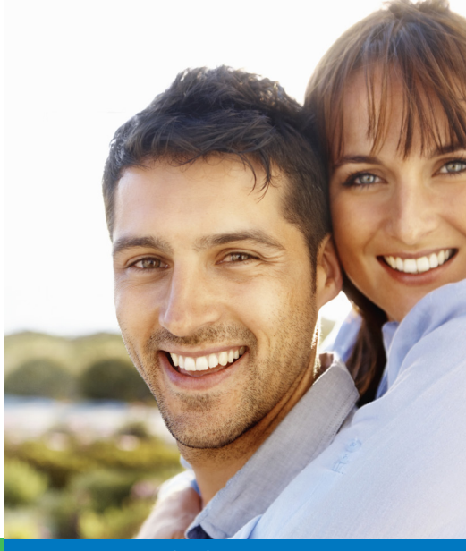
Sample benefits for resin-based composite fillings: